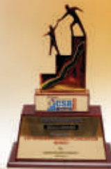
Greentech CSR Gold award in insurance sector 2015