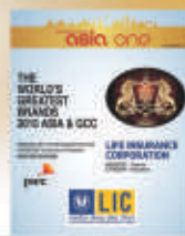
The World's Greatest Brands 2015 Asia & GCC