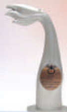
ABCi Awards 2016 Web Comm Online Campaign