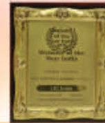
Website of the Year India Award 2015