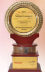
The Indian Insurance awards 2015 Best Non Urban Coverage